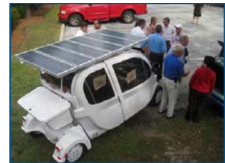
Read the article

Public and private sector representatives from JEA, JaxPort, JTA, NAS Jax, the City of Jacksonville, Clay County, Nassau County, RunWays Transportation Company, Teco Partners and Wise Gas shared their experiences, accomplishments and interests in alternative fuels. They also viewed an alternative fuel vehicle (AFV) exhibition including an electric and solar powered car from NAS Jax.